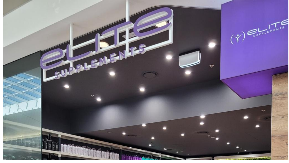
Elite Supplements has been hacked.

Elite Supplements informed its customers in an email, seen by NCA NewsWire, that the company had been cyber-attacked, which resulted "in one or more unknown parties gaining access" to some online customer data.